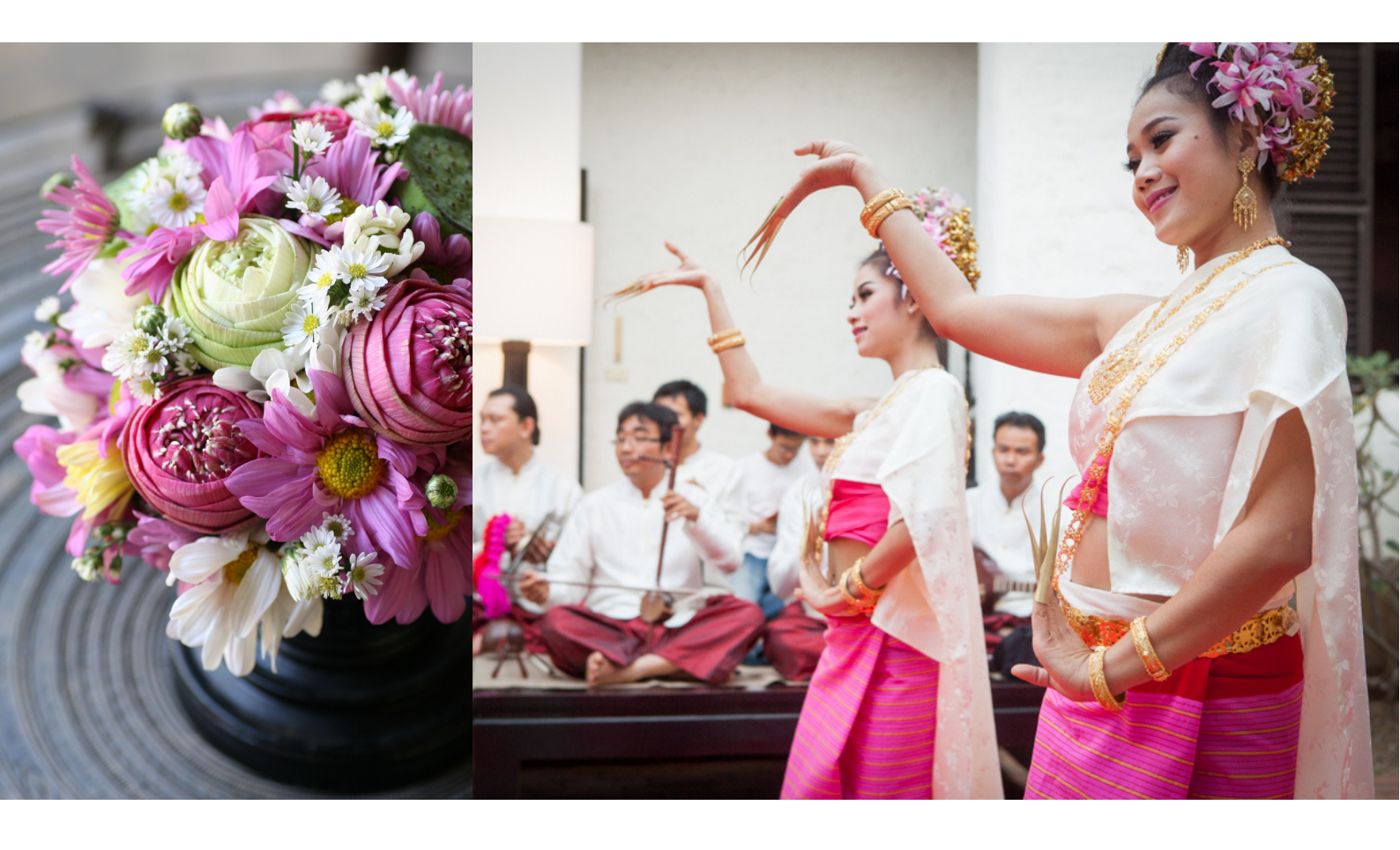
Lanna Music and Dance